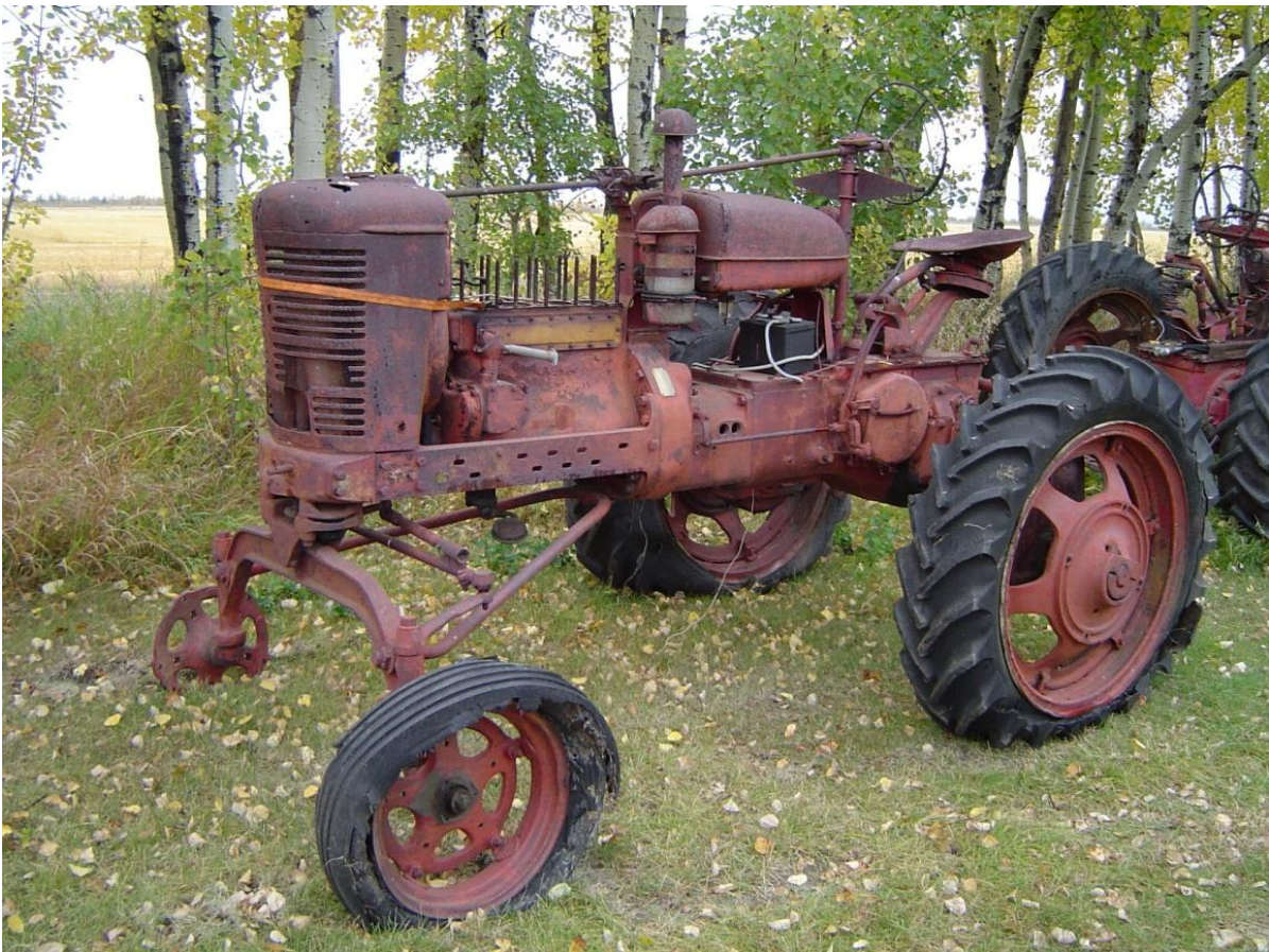
This is a pic of what I started out with.

Speaking of "how to", I am nearing the end of the trail on my MV. As I type this my tin work is sitting, ready to be painted. I usually paint the wheels first, sheet metal second, and the chassis last. So hopefully by the end of January I will be moving it outside.