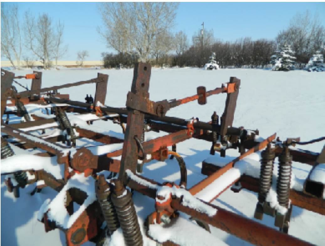
A view of the linkage from the front rocker shaft to the rear one and back to the wing rocker shaft.

All of Denny's land was in a block so he did not have to transport on the road. Those who remember 24 foot cultivators will remember that they did not get much narrower by winging up anyway, the wings were up but the shanks stuck out almost as far.